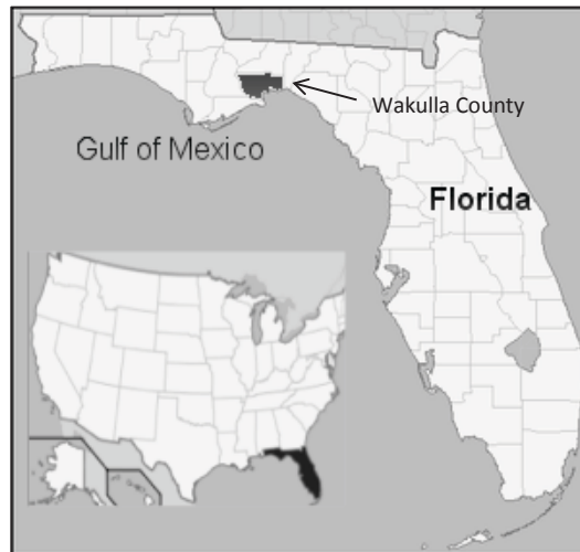
Figure 1. Site Location—Wakulla County, Florida

Wakulla Springs is located in Wakulla County (figure 1), just south of Tallahassee, Florida in the Woodville Karst Plain (WKP). The 6,000 acre site has many recreational amenities, including boat tours, hiking, horse trails, swimming, a lodge and restaurant, and recreational diving opportunities.